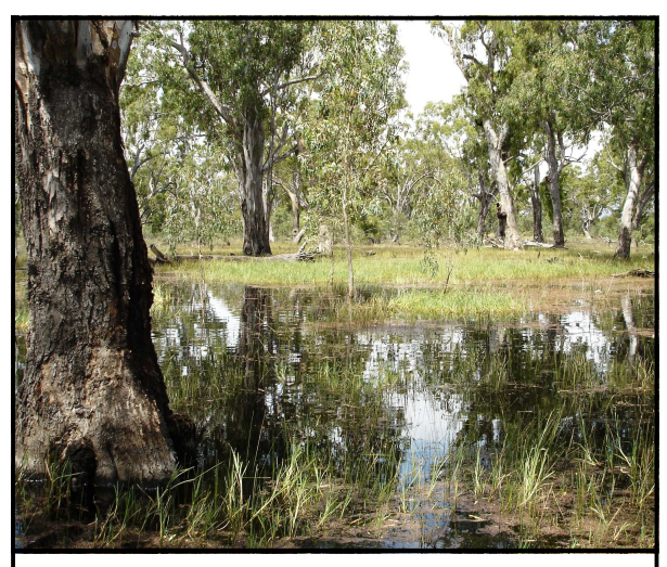
River Red Gum wetlands like the Walla Walla Swamp pictured here are suitable as Brolga breeding sites only if there are at least some open areas with well-spaced trees.